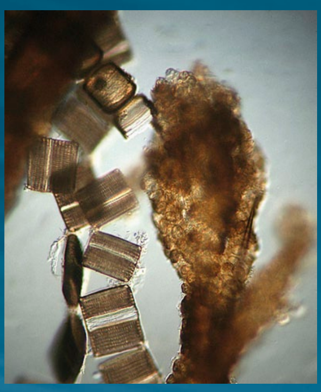
Two marine chain forms, Melosira moniliformis (upper left, circular) and Rhabdonema arcuatum (rectangular, centre) abut a brown alga smothered in the oval, epiphytic Cocconeis pinnata . Note the gelatinous pads linking the corners of the Rhabdonema chain.

based on the work of Foged and Hartley with an estimated 800 freshwater species and another 1,000 brackish and marine.